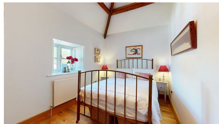
BEDROOM THREE 3.61m x 2.49m (11'10 x 8'2)

Double glazed window with fitted shutters, high vaulted ceiling with exposed purlins, oak flooring, panel radiator.