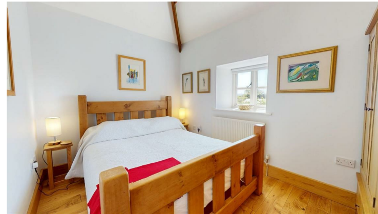
BEDROOM TWO 3.61m x 2.54m plus door recess (11'10 x 8'4 plus door recess)

Double glazed window to southerly aspect, high vaulted ceiling with exposed purlins and rafters, oak flooring, panel radiator.