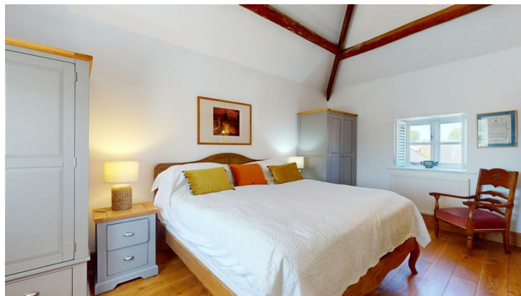
BEDROOM ONE 5.13m x 3.61m (16'10 x 11'10)

A very spacious through room with a high vaulted ceiling, it is light and airy with two double glazed windows one with fitted blinds, oak flooring, two panel radiators.