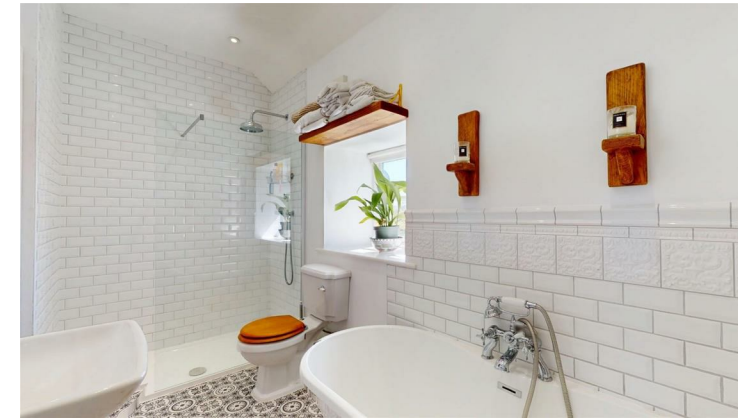
BATHROOM 3.58m x 1.63m (11'9 x 5'4)

Refurbished with a luxurious white suite comprising a contemporary free-standing roll top bath with chrome mixer tap, large walk-in shower cubicle with floor level tray, glazed screen and high output shower with monsoon style head, pedestal wash basin with tiled splashback and low level WC. Partially vaulted ceiling with downlighters, double glazed window, attractive floor tiling, chrome towel radiator.